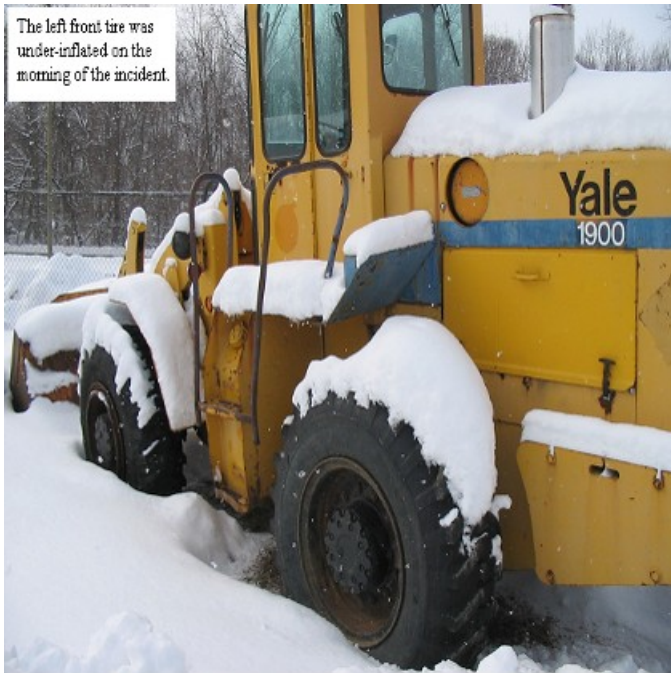
Photo 2. The loader that was operated by the victim on the morning of the incident. The left front tire was under-inflated at the time of the incident.

to warm up, the co-worker backed his loader over to the victim's loader and retrieved an air hose from his cab. The air hose was approximately 25 feet long and half-inch in diameter with a clip-on chuck on one end (Photo 3). It did not have an in-line pressure gauge. The co-worker connected one end of the air hose to the quick-connect fitting of the air compressor on his loader. According to the coworker, the victim was having trouble attaching the clip-on chuck to the tire valve stem. The co-worker attached the chuck to the tire valve for the victim. He then returned to his loader's cab and used the throttle control to maintain the airflow.