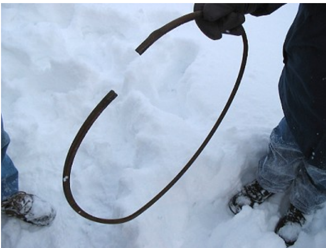
Photo 5. The lock ring that was propelled from the multi-piece rim wheel; it struck the victim while he was inflating the rim wheel.

As the victim continued inflating the tire, the co-worker placed a phone call from his cab to the owner of the company to find out where they should be plowing that morning. As soon as he hung up the phone, the co-worker heard a loud noise. He ran to where the victim was and saw the victim lying on the ground approximately ten feet from his loader with head injuries. The victim apparently was struck in the head by the lock ring that was propelled from the multi-piece rim wheel (Photo 5 and Photo 6). The co-worker was about to dial 911 when he saw a mall security truck driving by. He immediately stopped the truck and informed the mall security staff about the incident. The mall security staff called 911. Emergency medical services arrived within minutes. The victim was airlifted to a trauma center where he died two days later.