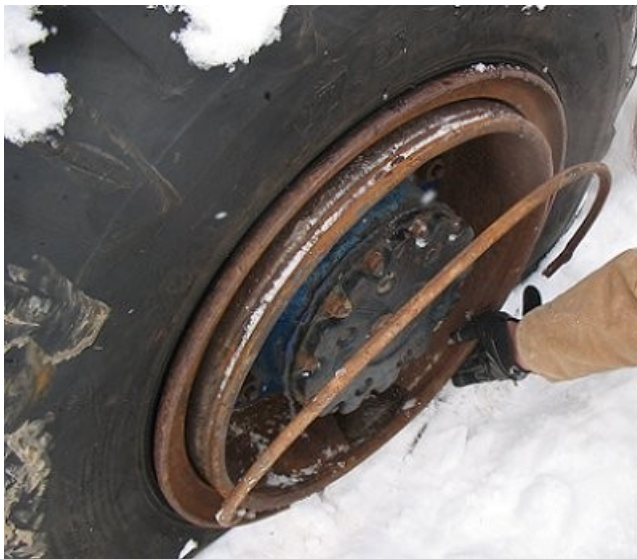
Photo 6. The dislodged lock ring was being refitted to the multi-piece wheel that was involved in the incident.