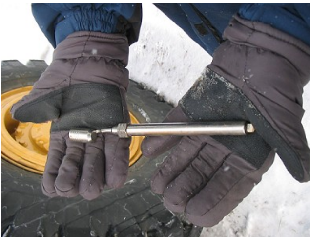
Photo 3. The air hose that was used by the victim and the co-worker during the incident. The hose had a clip-on chuck on one end. It did not have an in-line gauge (Photo courtesy of OSHA).

The initial tire pressure was not checked. Periodically, as the tire was being inflated, the victim checked the air pressure at the tire valve with a hand-held pressure gauge (Photo 4). According to the co-worker, the victim informed the co-worker that the air pressure in the tire was about 15 to 20 psi after a few minutes of injecting air into the tire. This was well below 28 psi, that was 80% of the