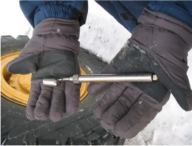
Photo 4. The hand-held air pressure gauge used by the victim during the incident.

manufacturer recommended pressure of 35 psi. The co-worker told the victim not to let the pressure exceed 30 psi.