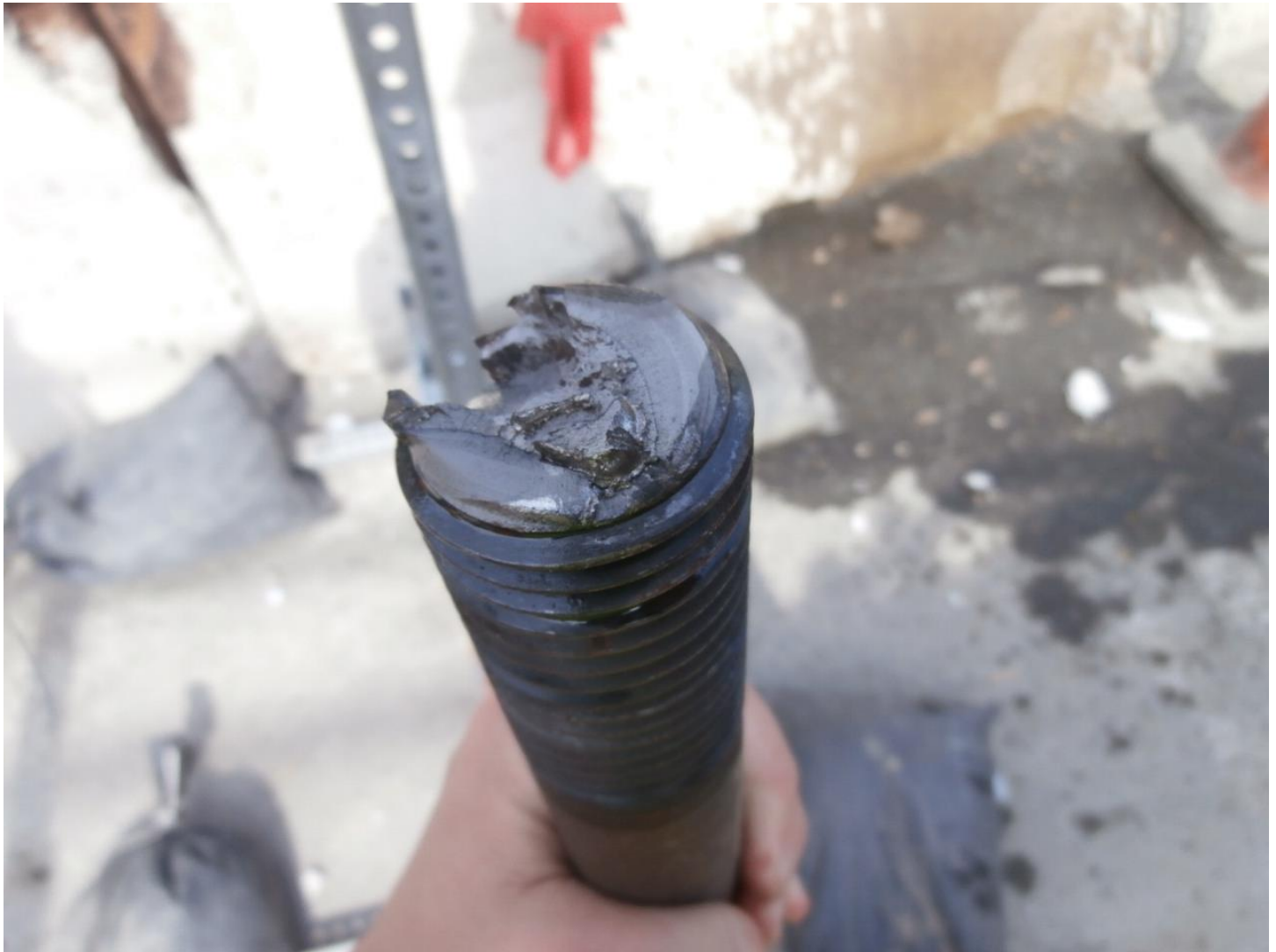
Photo 6. The clamp bolt broken from the vibratory pile driver had metal failure.

Both fixed and movable jaws had two clamp areas with teeth: Each clamp area was approximately 1 inch wide and 7 3 / 4 inches long with 10 teeth (Photos 7 and 8). All four clamping surfaces had worn or broken teeth: The peaks were either broken off or worn flat. The sections that had worn or broken peaks were approximately 4 inches long from the end of the jaws where they gripped the piles. The jaws were mis-aligned in all three dimensions resulting in unparallel gripping surfaces and mis-aligned and partially engaged teeth.