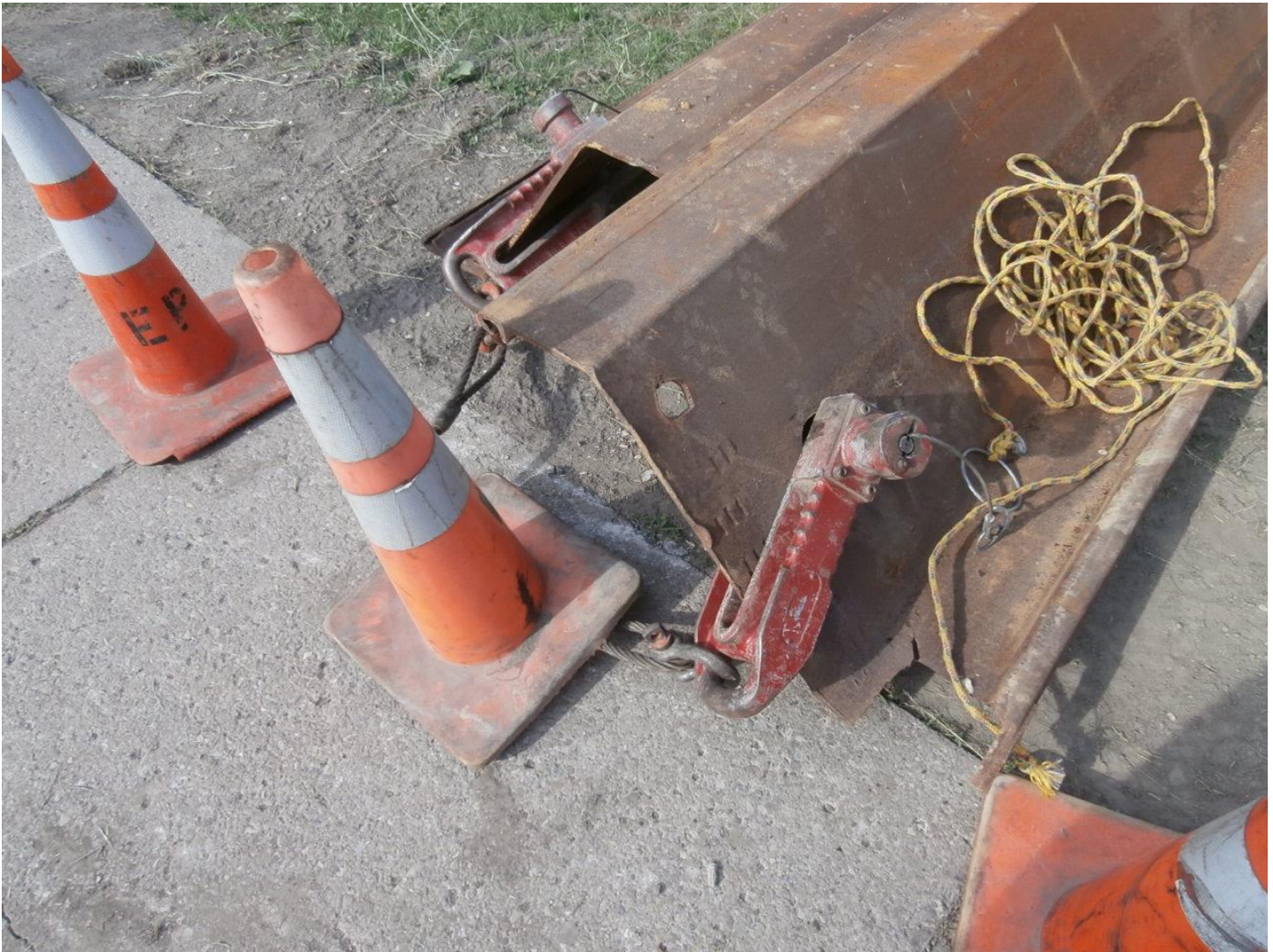
Photo 5. Pile shackles with ground release attached to a pair of sheet pile (photo courtesy of OSHA).

At approximately 11:00 a.m. the traffic lights at both ends malfunctioned. Instead of alternating in red or green cycles, both lights went to flashing yellow simultaneously. The decedent was first directing the traffic at the north end of the bridge. Once the traffic lights malfunctioned, the traffic kept encroaching into the work zone. The foreman sent the decedent to the center of the bridge so that she could better control the traffic (Figure 2. Incident site sketch).