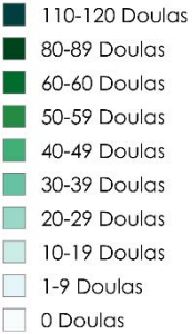
NYS Medicaid Doulas by County Served