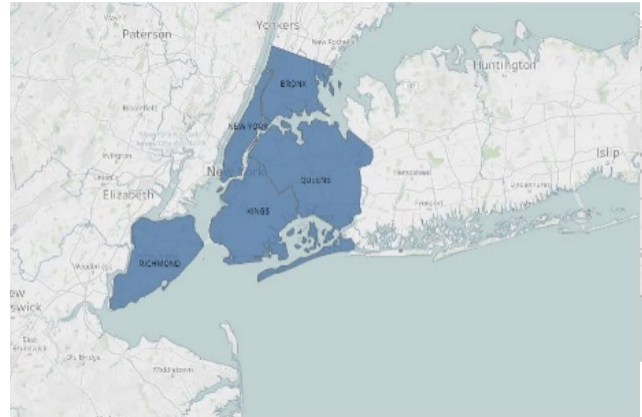
Service Area: Counties in which Providers of Amida Care Innovator Network, Inc. Offers Services